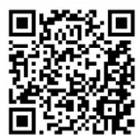
Japan Coast Guard YouTube