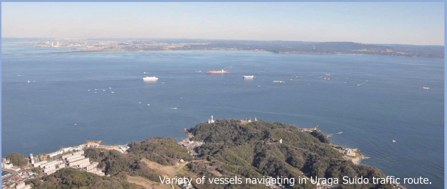
Variety of vessels navigating in Uraga Suido traffic route.

In order to take all possible measures to prevent accidents caused by dragging anchor when typhoon/stormy weather and extreme sea condition are expected, a system concerning recommendation and order for ships to evacuate bays and to restrict anchoring will be established.