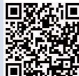
Japan Coast Guard Instagram