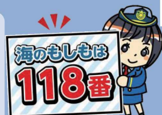
Maritime emergency call number 118